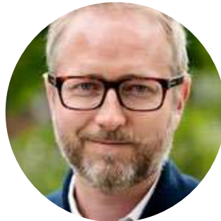
Bård Vegar Solhjell